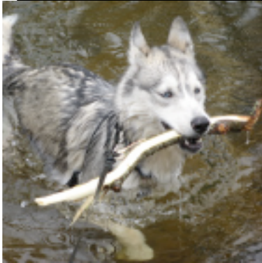
Foxy (b/w) Nilla (white)

We adopted Bowser several weeks after our dog passed away. We knew that we could not replace our old dog, but he sure made grieving easier. Bowser is a joyful, VERY vocal dog with a lot of husky energy. He lives in Dallas, OR with us, 2 cats and another husky (Baya). Bowser enjoys spending days chasing Baya, playing in the pool, and going to the dog park. At home, he is pretty submissive, but at the park - he is top dog. He does a prance at the gate when new dogs arrive, then picks up a tennis ball and struts around the park until the new dogs give him proper attention. We call it his "handsome boy walk." At the park, he likes to be the fastest dog and will chase other dogs, jump over them from side-to-side to show how much quicker and more agile he is. He enjoys long runs with his humans, camping, and having doggie friends over to visit. We are excited for the snow to come this year & are planning on hooking Bowser & Baya to a sled so they can pull it in a large nearby field.